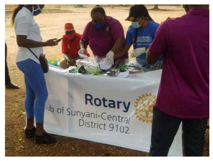
Rotary International Provides Covid Relief through Grants. Read about the program > <u>HERE</u>.

*Guidelines are forthcoming to ensure project contributions are an actual increase in total contributions to the Annual Fund.