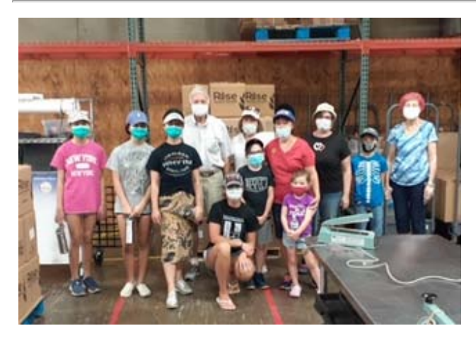
Submitted by Sue Hicks

WELCOME to all the new members in the District.