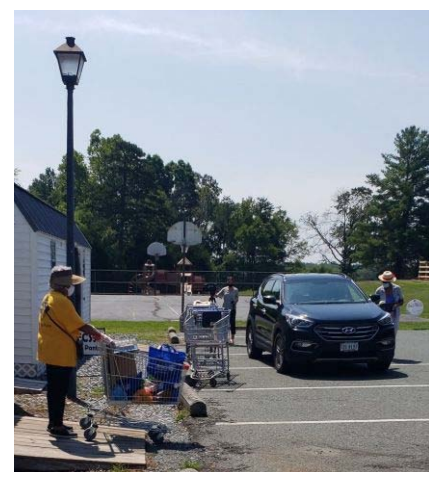
To read a general summary of the recent Covid-19 grants go > <u>HERE</u>.